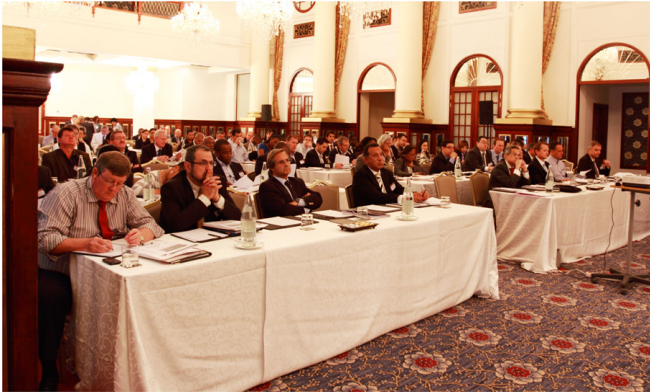
3rd Annual Africa Gas & LNG Summit, Maputo, September 2012