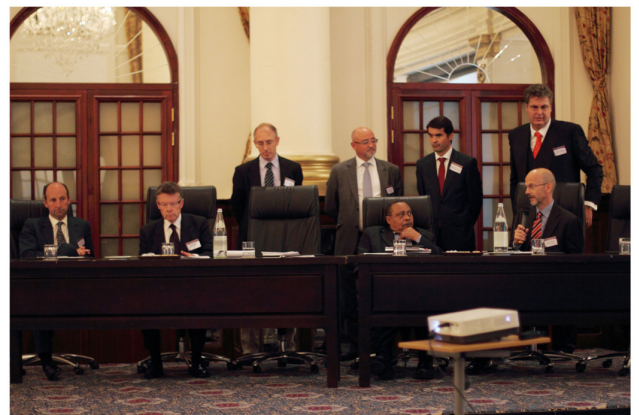
3rd Annual Africa Gas & LNG Summit, Maputo, September 2012