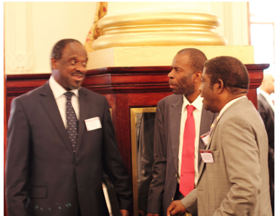
3rd Annual Africa Gas & LNG Summit, Maputo, September 2012