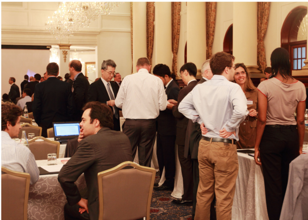
3rd Annual Africa Gas & LNG Summit, Maputo, September 2012