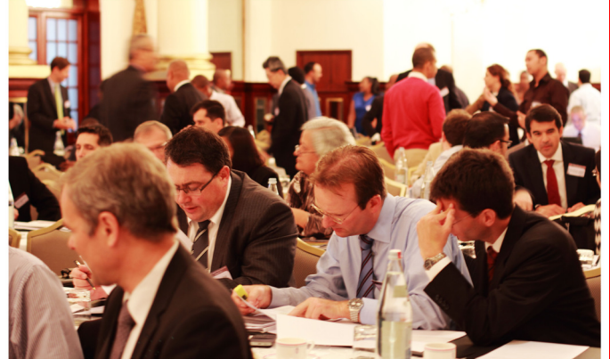
3rd Annual Africa Gas & LNG Summit, Maputo, September 2012