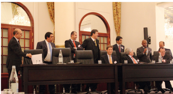
3rd Annual Africa Gas & LNG Summit, Maputo, September 2012